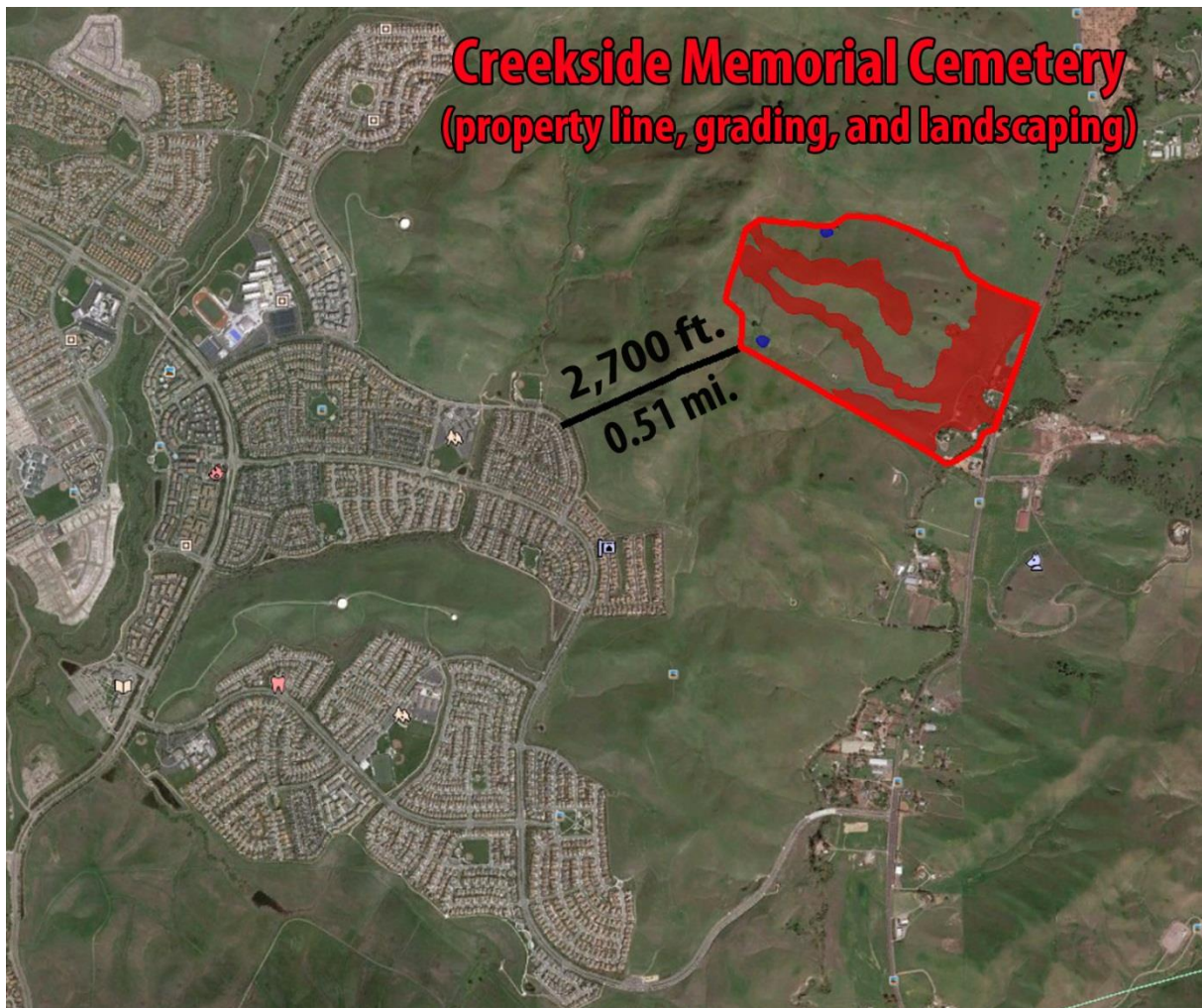
Figure 3. Creekside Memorial Cemetery would lie just a half mile (2,700 ft.) from the Windemere community.